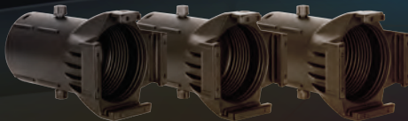
26°, 36°, 50° IP LENS TUBE